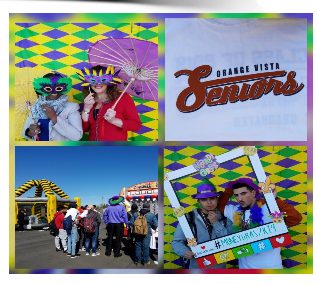
Orange Vista's Annual FAFSA celebration MoneyGras